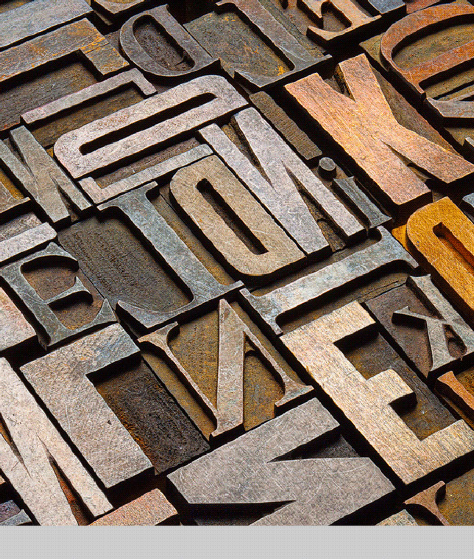
Kindle Fire User's Guide